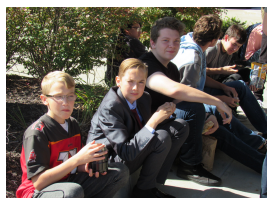
Having fun at lunch