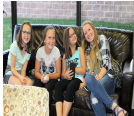
Taking a break with friends