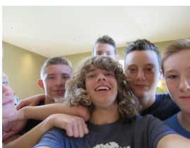
Hanging out after school