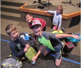
Time for pick up

This year many students who were previously in 6th grade became 7th graders. Also, as well as moving up in a grade, they transitioned from FBC to GBC. This was a big transition. FBC consists of grades K-6th, whereas GBC is home to 7th-12th grades. Most 7th graders liked the change from FBC to GBC. At GBC they feel they have more freedom and privileges as they move between classes with more responsible and mature older kids. They also have the freedom at lunch to choose to sit inside or outside. They report that this is a fun change to their schedule. Although they like the transition they still miss some of the things they liked at FBC like PE, no homework and no tests. They are excited to see more friends come to GBC next year when they transition over. They would like for younger students to know that the work at GBC is challenging, but not as hard as they thought. In the end, moving up is just another part of life and these 7th graders are welcoming the challenge!