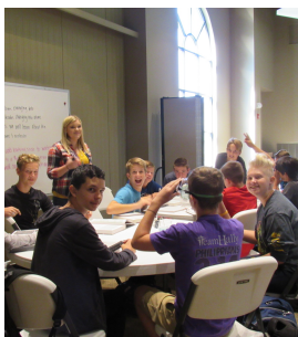
Having fun in Physical Science