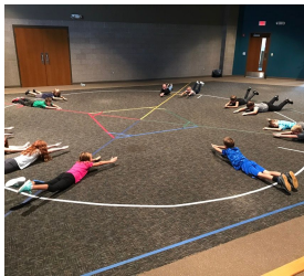
Working out in PE